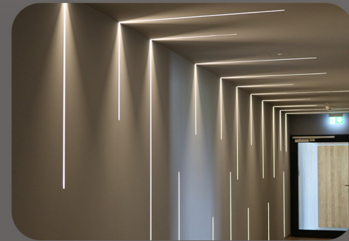
LED Profiles: Linear lighting profiles for architectural and decorative use.