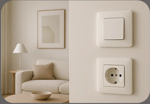
Wiring Devices: Switches, sockets, and modular systems.