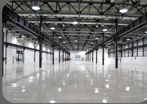
Industrial Lighting: High-durability lighting for factories and industrial facilities.