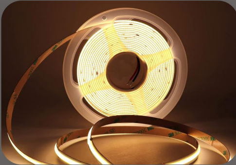
Strip LED: Flexible, energy-efficient lighting for creative designs.

Licht offers a wide range of categories to cover every lighting requirement: