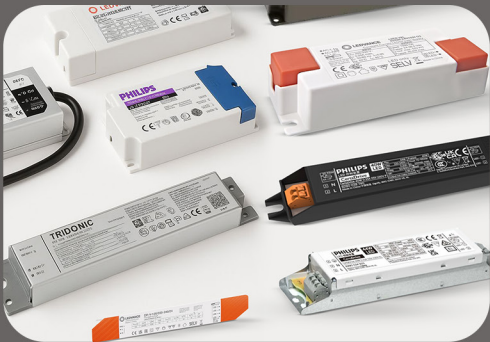
Power Supplies & Drivers: Reliable drivers and transformers from global leaders