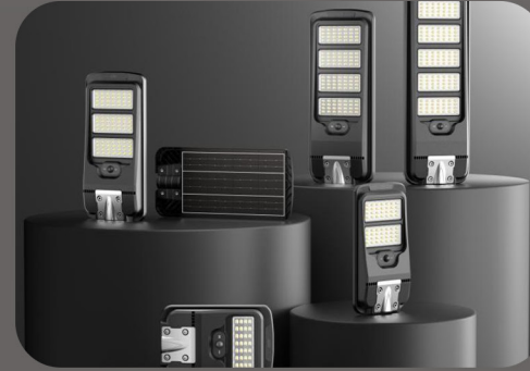
Solar Lighting: Sustainable outdoor lighting powered by solar technology.