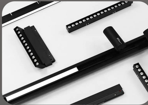
Magnetic LED Systems: Modern, modular solutions for professional projects.